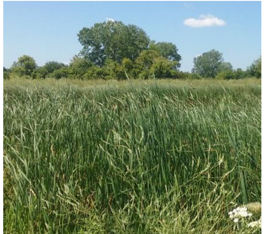
Narrow-leaved/Hybrid Cattail Non-native