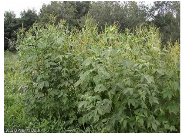
Giant Ragweed Native

http://www.minnesotawildflowers.info/udata/r9ndp23q/pd/ambrosia-trifida-7.jpg