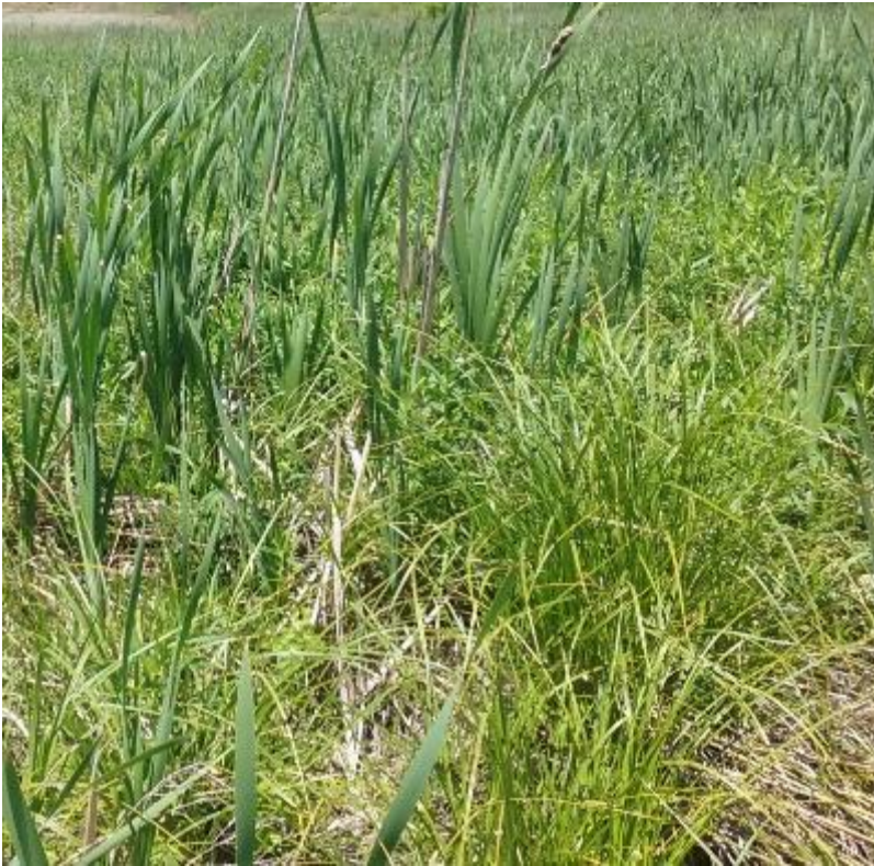
Broad-leaved Cattail Native